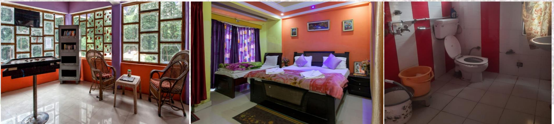
Deluxe Accommodation At Ghangaria – Comfort Stay With Healthy Meals

Early morning we leave from Joshimath for Govindghat, which is the starting point for the trek. From Govindghat we drive to Pulna 3km by local jeep, from here it is a gradual ascent along a well - maintained pilgrim trail to the camp at Ghangaria - the base from where day walks can be made into the valley of flowers. Arrange porters and prepare for the trek. After a light breakfast, 12 km trek up to Ghangaria. Dinner & Night halt at Hotel / Camp.